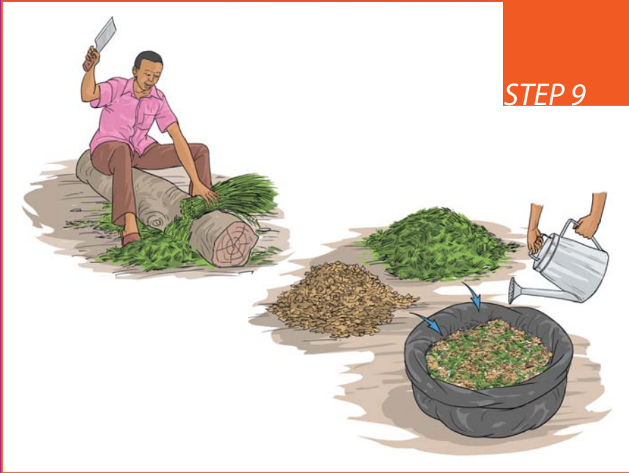
Figure 7. Preparing sweetpotato vines and roots for ensiling

To prepare the material for ensiling, chop the sweetpotato vines and roots to be ensiled into pieces not more than 2.5 cm long (Figure 7).