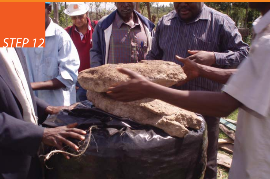
Figure 10. Sealing the tube after ensiling

Bunch the excess tubing at the top together, remove all excess air so the plastic is in touch with the ensiled material and tie a tight knot, using the twine. Place heavy stones on top of the silo to ensure continued compaction during fermentation (Figure 10).