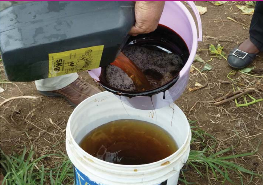
Figure 8. Preparing molasses

To prepare the material for ensiling, chop the sweetpotato vines and roots to be ensiled into pieces not more than 2.5 cm long (Figure 7).