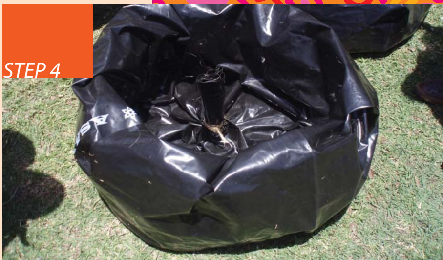
Figure 3. Sealing the bottom of the silage tube

To make a good seal at the bottom of the silage tubing, first open up the tubing. Then on one open end (that will be the bottom of the tube), make even pleats about 20 cm long starting from the end towards the centre on each side of the tubing. Then twist the pleats together and tie off with the rope making a strong knot. Then turn the tubing inside out, so that the tied knot is on the inside (Figure 3).