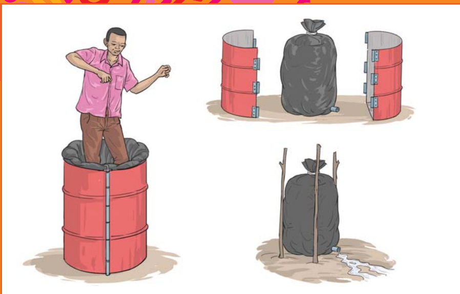
Figure 9. Compacting the sweetpotato vines and roots in the tube

Fill the tubing with alternate layers of the chopped vines and roots and the molasses/water mixture. Each layer of vines and roots should be 20 to 30 cm high; then sprinkled with the molasses mixture until it is thoroughly wet on top. Each layer must be compacted before adding the next layer. One person can compact using feet as shown in Figure 9.