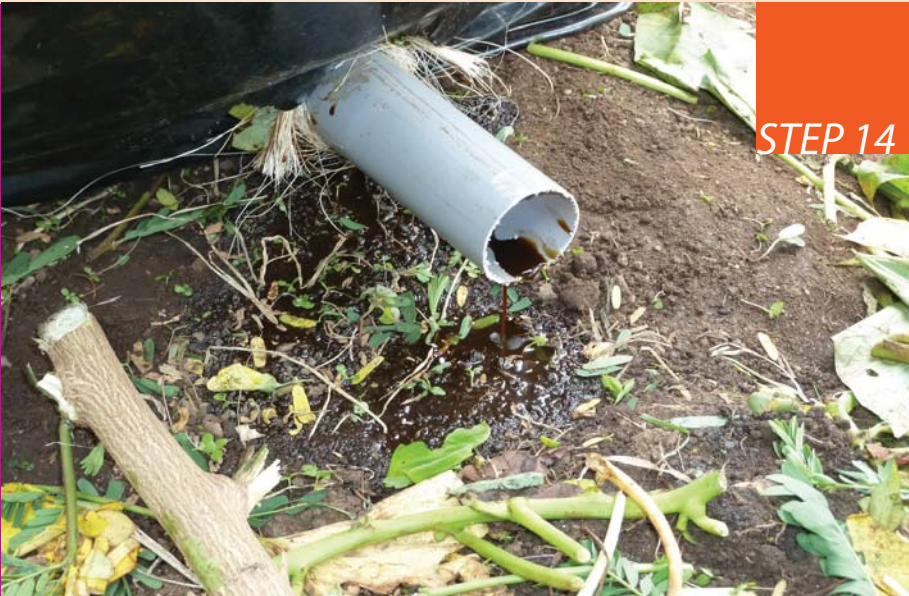
Figure 12. Removing excess effluent from the silage tube

Remove the rods to remove the compacting drum. Anchor the filled tube silo with three poles to prevent the silo from collapse due to drainage of excess effluent from the silo (Figure 11).