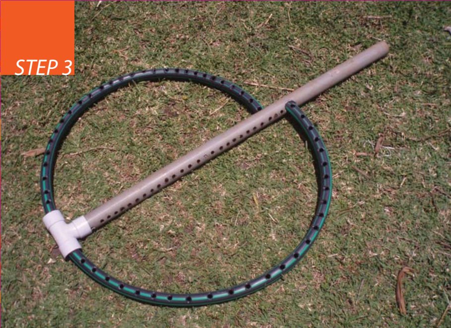
Figure 2. Assembling the internal drainage system for the silage tube.

Pass the rubber tubing through the top holes in the drainage pipe, so that the open ends of the tubing align at the bottom of the pipe as shown in Figure 2.