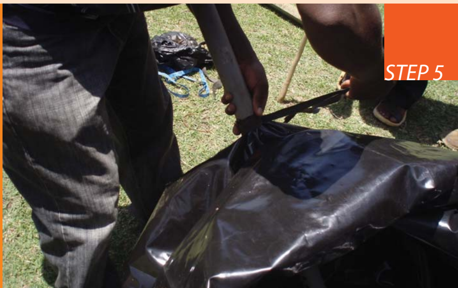
Figure 4. Making the external drainage system of the silage tube

Make a 3.5 cm diameter hole using a knife at the side of the tube, about 43 cm from the tied knot. Then take the joined drainage pipe and rubber tubing and fit it into the inside of the silage tubing so that the bottom of the drainage pipe goes through the newly made hole, extending about 20 cm beyond the hole. Using the twine, tighten the plastic around the drainage pipe as shown in Figure 4.