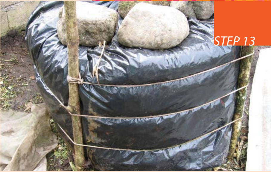
Figure 11. Anchoring the silage tube firmly on the ground

Remove the rods to remove the compacting drum. Anchor the filled tube silo with three poles to prevent the silo from collapse due to drainage of excess effluent from the silo (Figure 11).